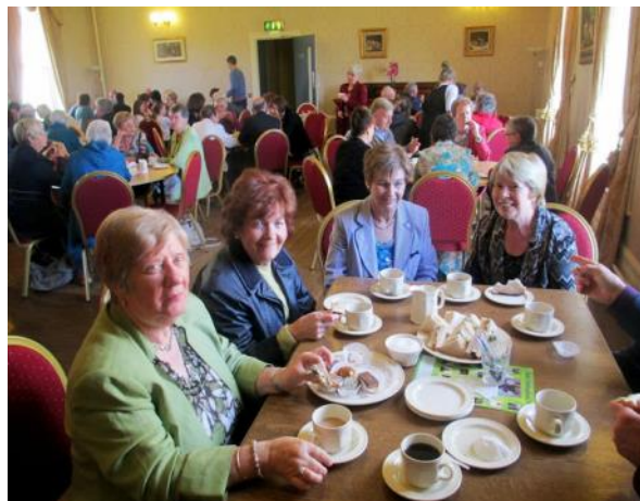
Pictured are some of those present at the Year 8 thanksgiving Mass in Dromantine, enjoying a cup of tea and a chat afterwards.