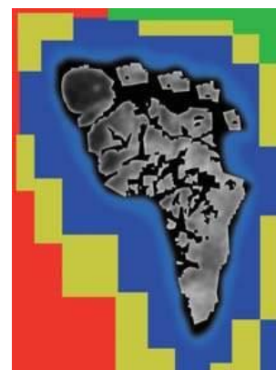
The FOA logo, a foot as a map of Africa, symbolising their motto "Small Steps Together"

The application process has just opened for volunteers for the programme in summer 2014. More information is available on both the FOA or SMA websites or on the FOA Facebook page.