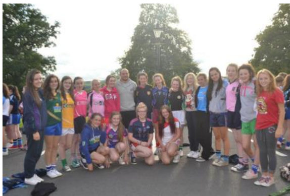
Ulster and Ireland rugby star Rory Best with some of the girls when he visited Camp this year.

As well as lunchtime singing, a great display of talent was produced during each camp. The range of individual talent, including singing, Irish dancing, instrumental music, stand-up comedy, poetry and contemporary dance was astounding, while the team competitions produced some entertaining and unique interpretations of